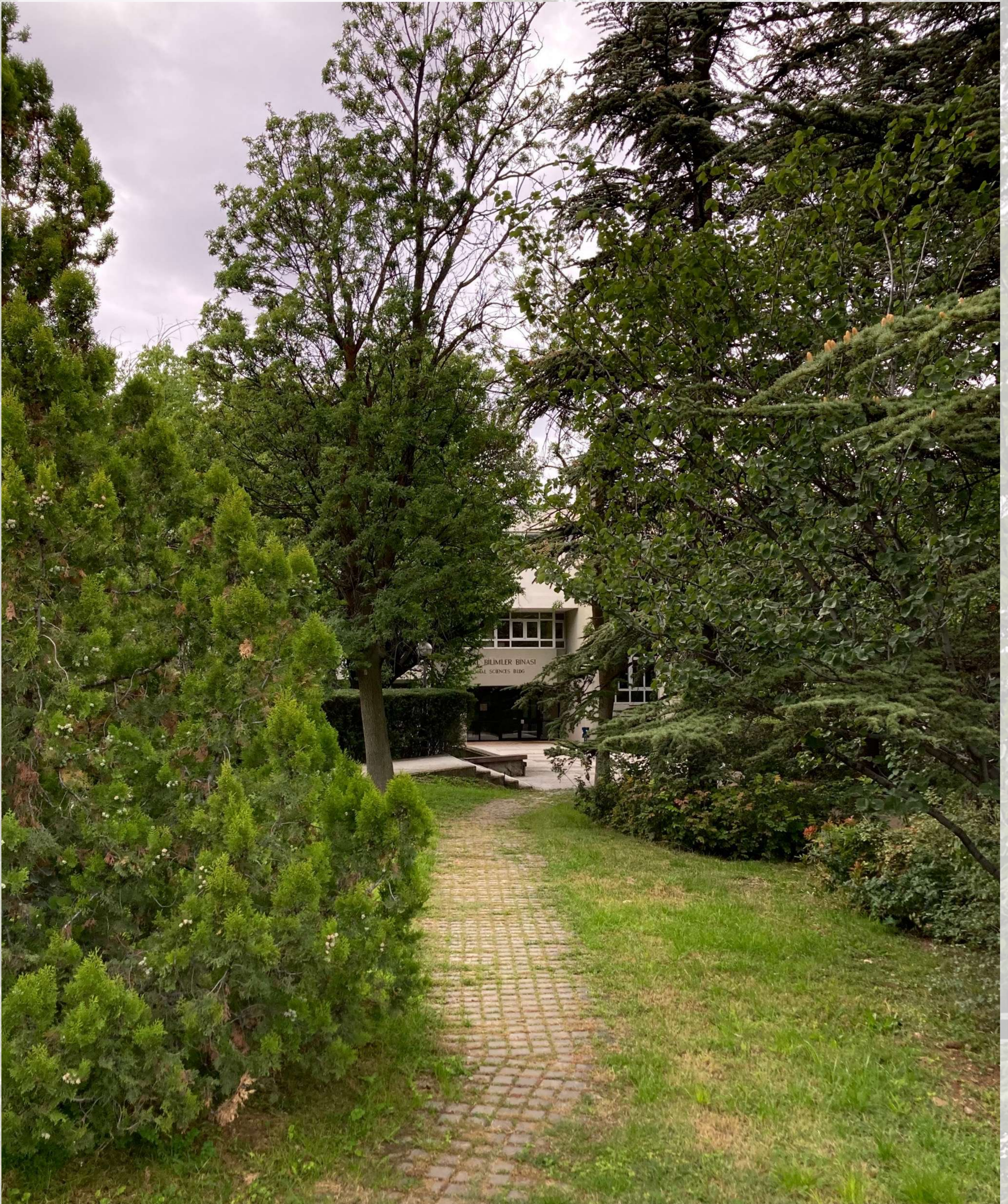
Social Sciences Building